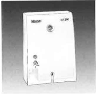
Photo electric switch for surface-mounting outdoors